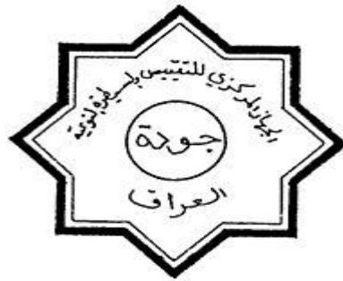
National quality mark of Iraq