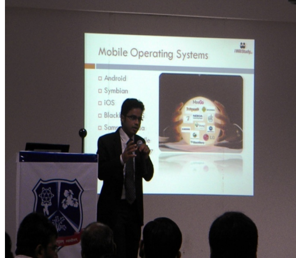
Important of Mobile Operating System