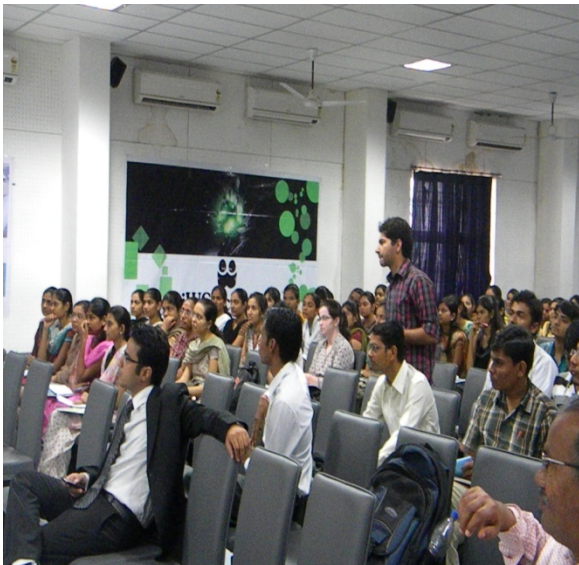
Brainstorming Session (Question-Answer)