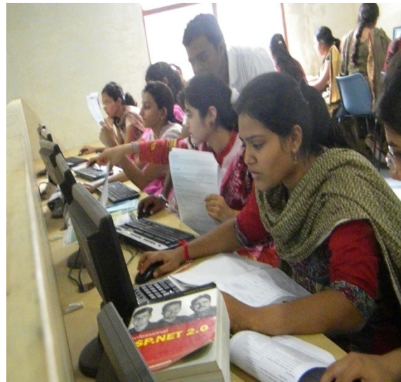
Delivered practical session on Android Application by iwillstudy.com