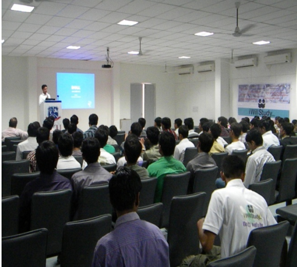
Addressing students on Android Application