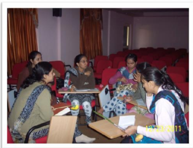
FDP 5, Rajkot - Christ Institute of Mgmt.

- MCA faculty comment, FDP 6 (Ahmedabad)