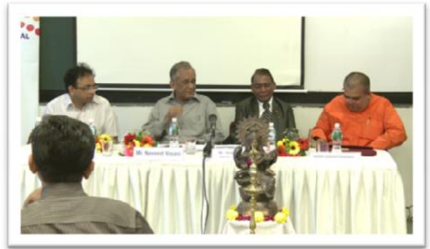
FDP 1, Ahemdabad - Ahmedabad Mgmt. Association