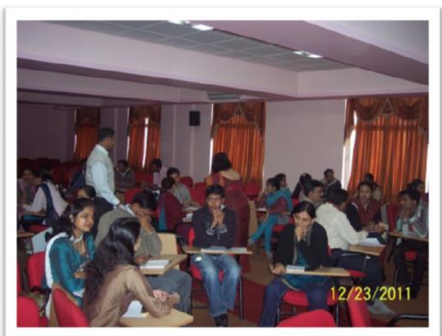
FDP 5, Rajkot - Christ Institute of Mgmt.