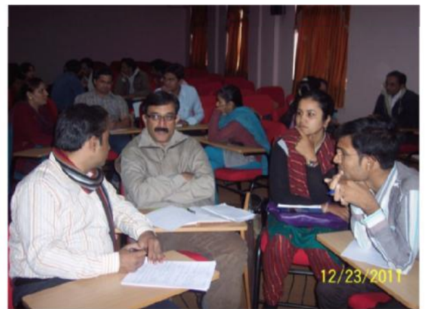
FDP 5, Rajkot - Christ Institute of Mgmt.