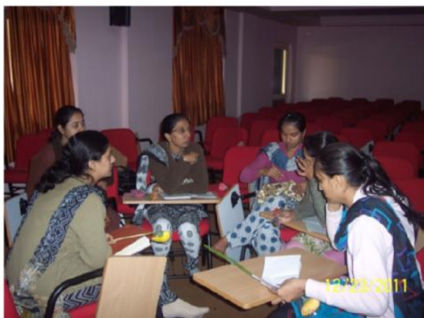
FDP 5, Rajkot - Christ Institute of Mgmt.

“I have been in the teaching field for the past 4 years, these 2 days have taught me the shift from being a teacher to becoming a facilitator.”