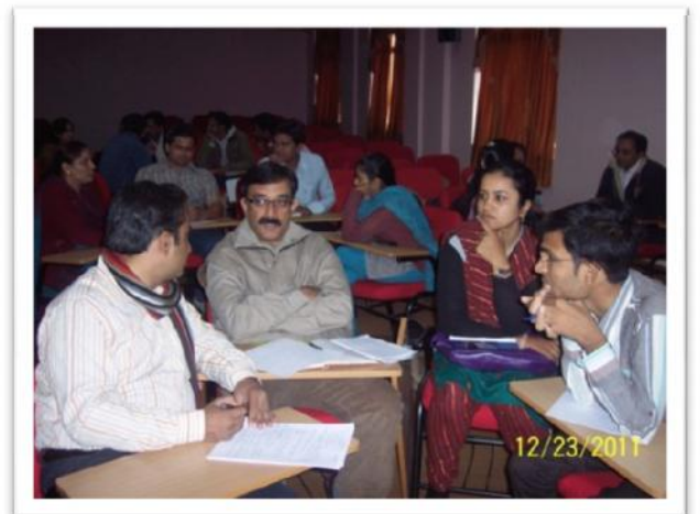
FDP 5, Rajkot - Christ Institute of Mgmt.

“The university, i.e. GTU, has been a catalyst in this process of innovation and the companies at large will be getting a benefit of skilled contributors in the near future.”