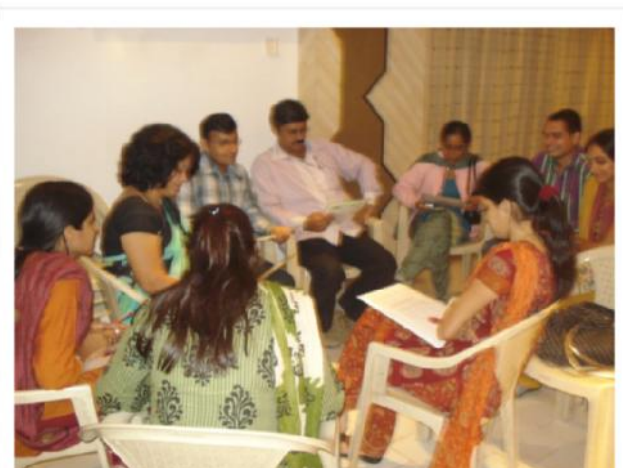
FDP 4, Surat - Sarvajanic College of Engg. & Tech.

Mehul Pandya, AV Parekh Technical Institute, FDP 5 (Rajkot)