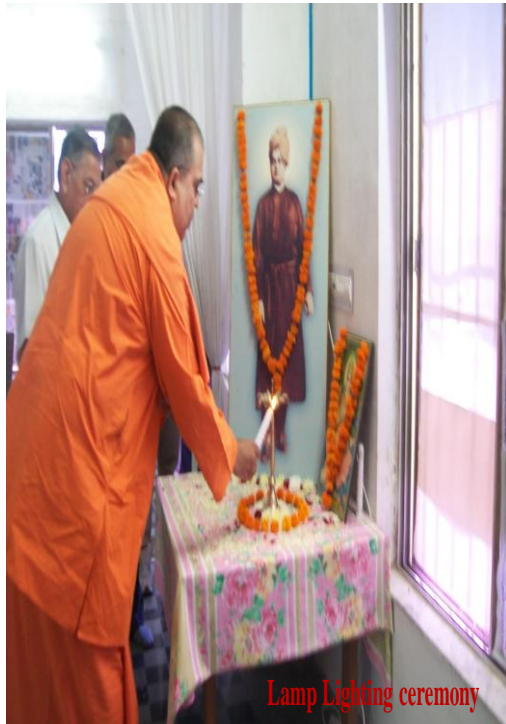
Lamp Lighting ceremony