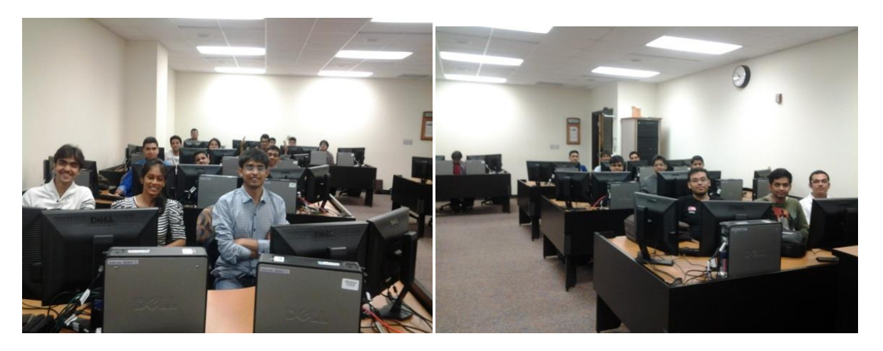
Students attending Class on First Day at Fiedler Hall