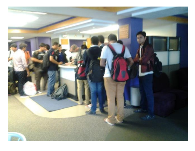
Students Checking in at Front Desk of West Hall