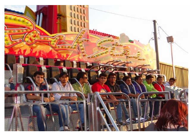
Students in Amusement Park at Wamego town On

Students visited Wamego town near Manhattan on July 4, 2013 to watch excellent and orderly fireworks as a part of independence day celebrations of USA. Students enjoyed different amazing and thrilling rides in the park near the site of celebrations. The visit was facilitated by DCE of KSU. The group from South Korea had also joined the celebration and students are interacting with this group as well.