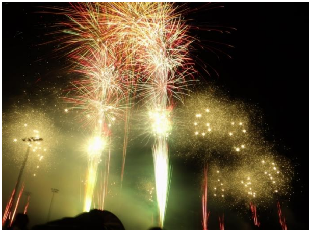
Fireworks at Wamego