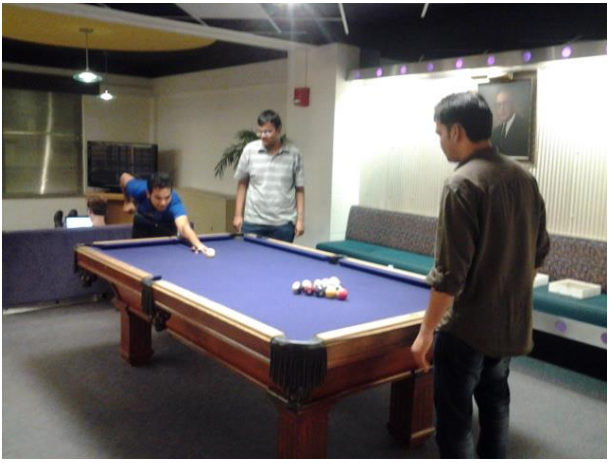
Students playing pool and relaxing after assignments