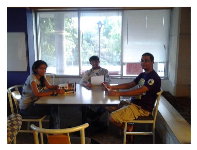
Students planning at the front lobby