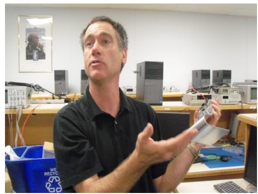
Head ECE explaining about embedded System