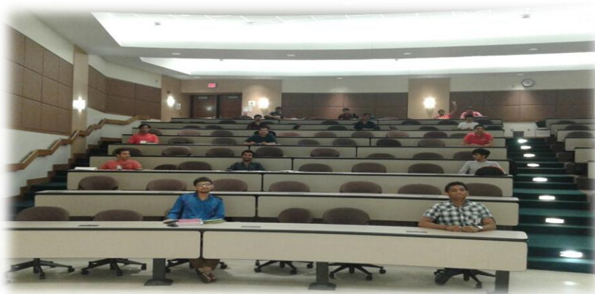
THE FIEDLER HALL, WHERE ALL THE STUDENTS GAVE THEIR REFRIGERATION EXAM. 4 EXAMS WERE CONDUCTED, 2 MIDTERMS AND 2 FINAL SEMESTERS , 1 FOR EACH SUBJECT

After the stressful exams, a trip to Wamego was organized to enjoy the Independence Day celebrations on the 4 th of July, a wonderful parade, carnival and fireworks unmatched.