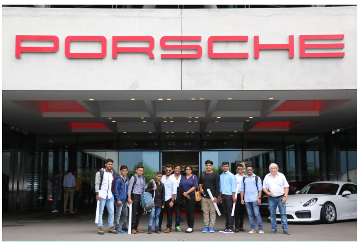
(Group photo Porsche)