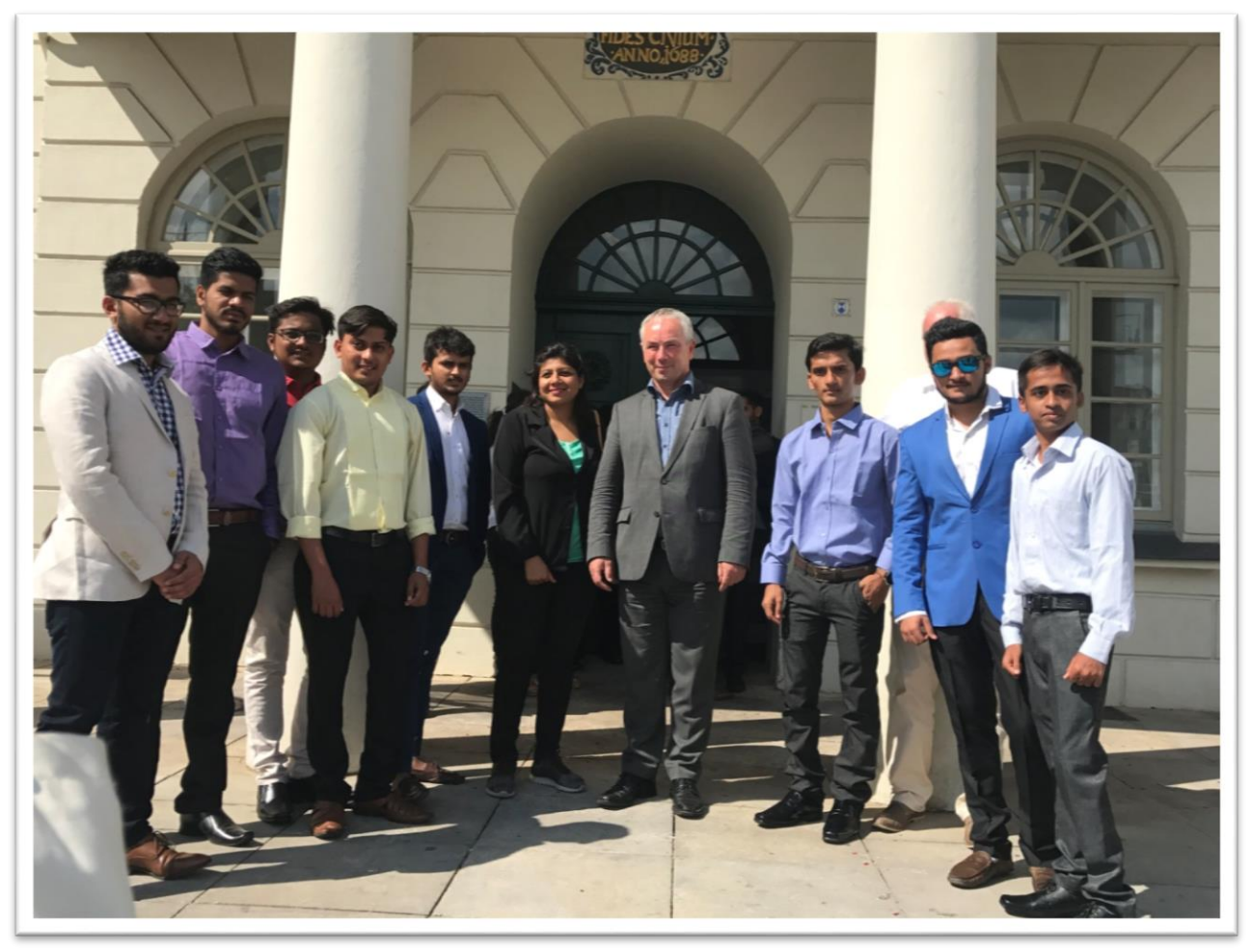
(Mayor of Wismar)

With mayor of wismar on 3<sup>rd</sup> July.