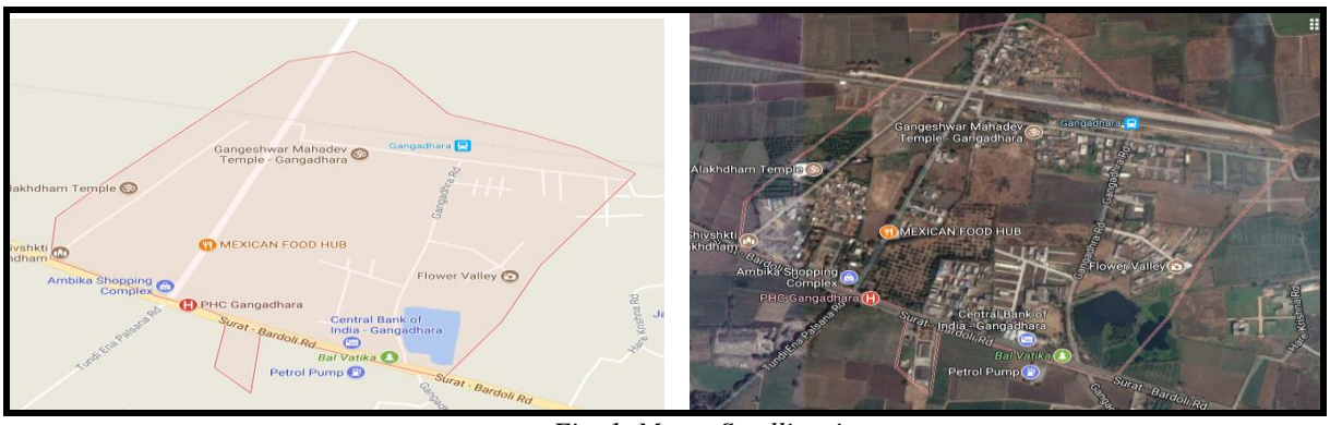
Fig. 1 Map – Satellite view